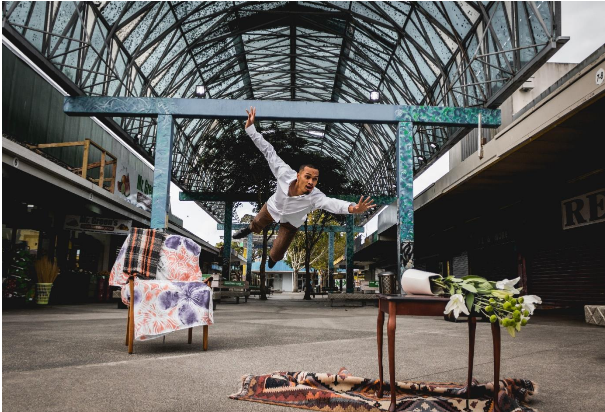
Goodbye Naughton, Te Ata Festival, Porirua | Aotearoa/New Zealand

Our guide to ensure your students get the most out of the 2020 New Zealand Festival of the Arts